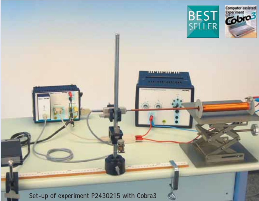
Set-up of experiment P2430215 with Cobra3