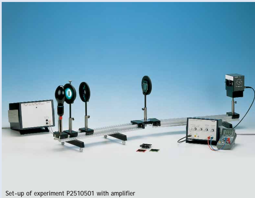
Set-up of experiment P2510501 with amplifier