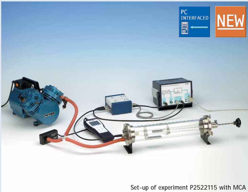
Set-up of experiment P2522115 with MCA